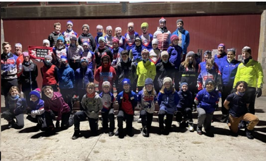
Middle School Team