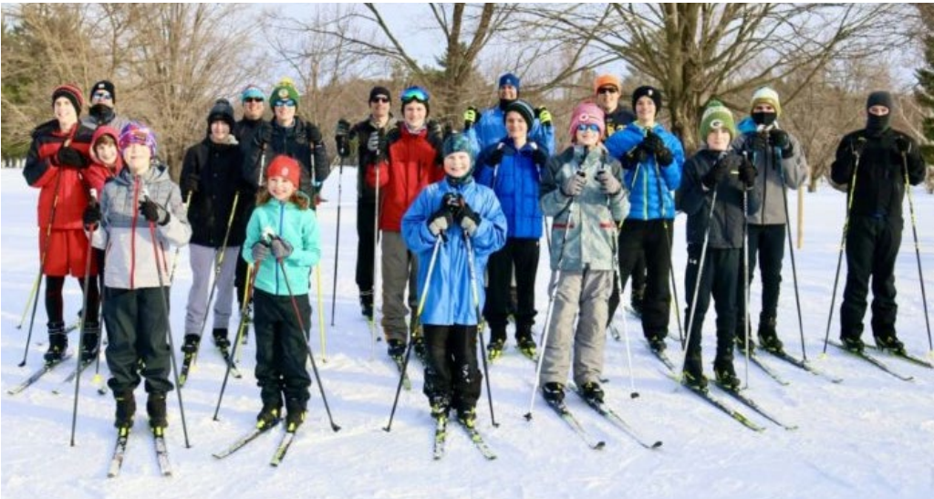
Varsity Ski Team