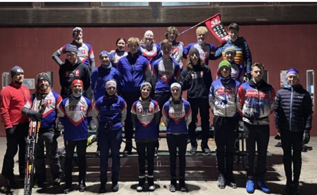
High School Team