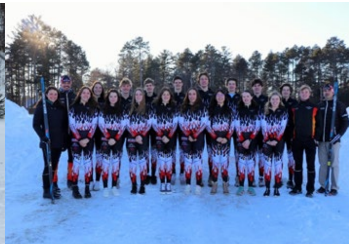
High School Team