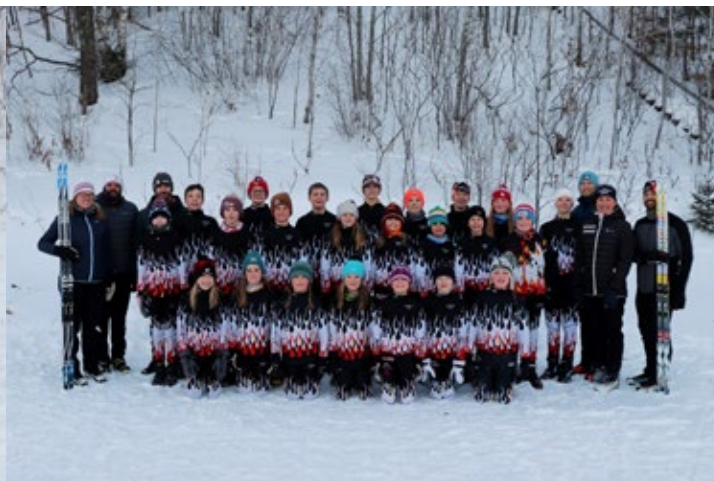
Middle School Team