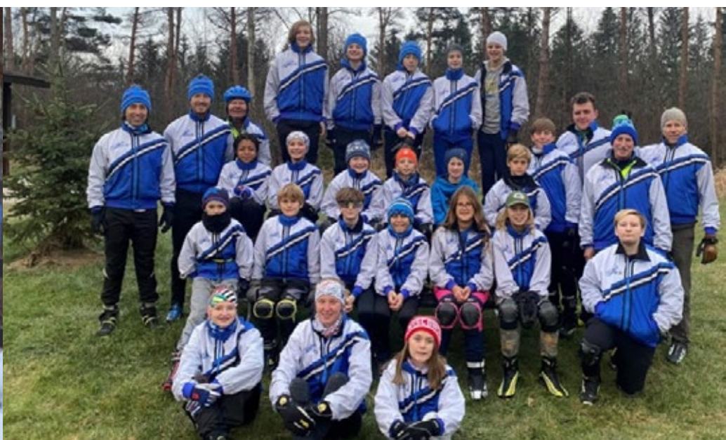
Middle School Team