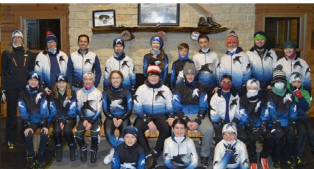
Middle School Team