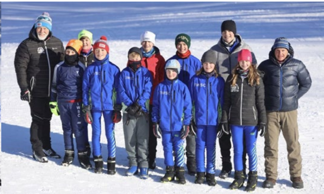
Middle School Team