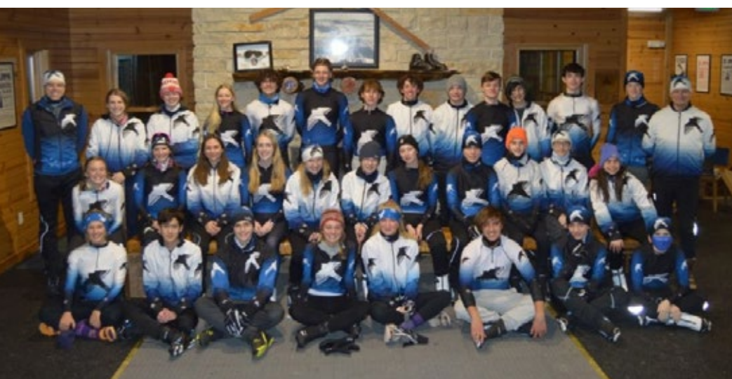
High School Team