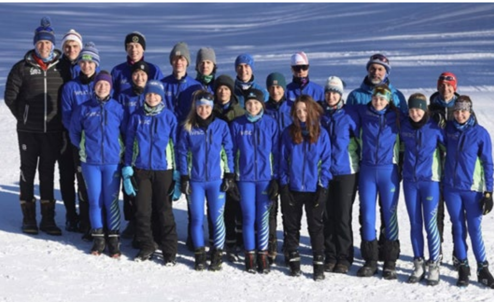
High School Team