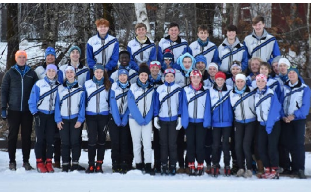
High School Team