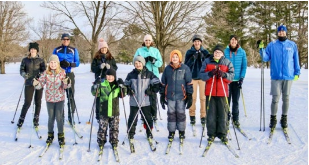
Youth Ski Team